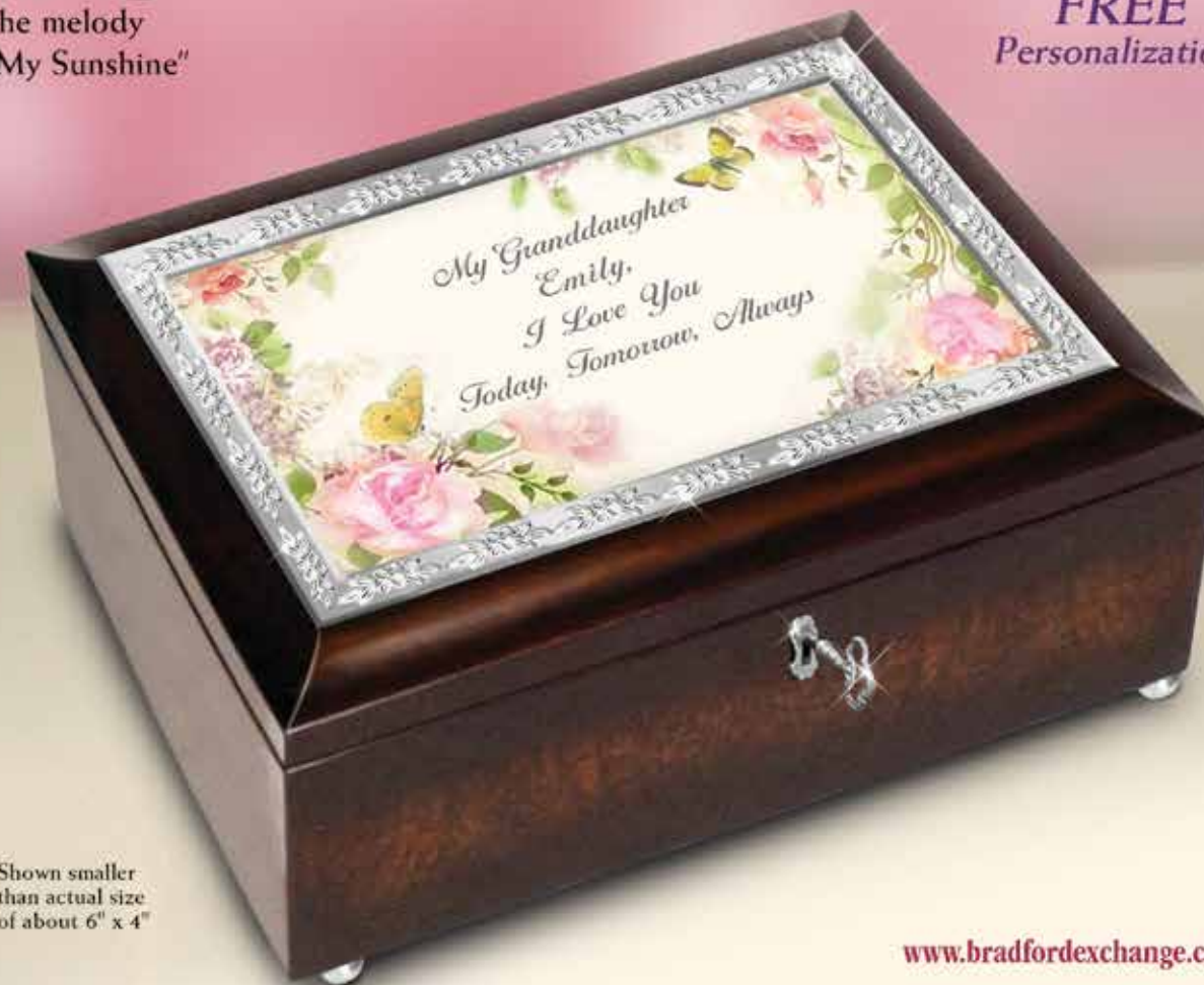
Shown smaller than actual size of about 6" x 4"