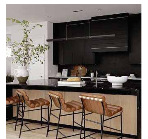
DESIGNER GINGER CURTIS prefers a relaxed modern approach to design, as pictured in this sleek kitchen.